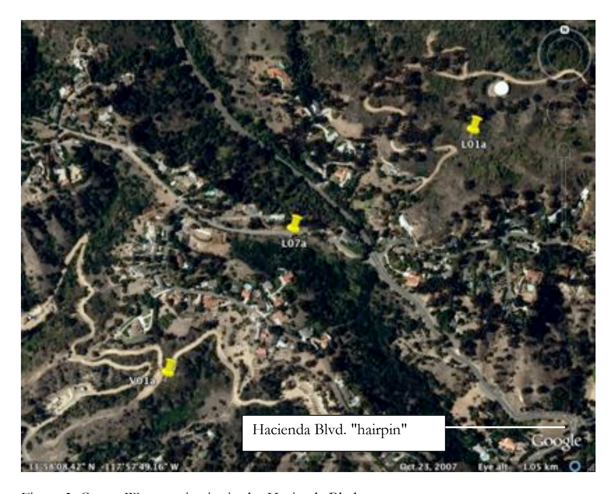
Figure 3. Cactus Wren territories in the Hacienda Blvd. area.

Three other sites were located along the western boundary of Schabarum Park (County of Los Angeles, Fig. 4), though this area may only support a single pair between them (down from four vocalizing birds on 14 May 1997, Cooper unpubl. data). This area has burned several times since then (including in 1998), and the extent of cactus scrub here has contracted noticeably, replaced by non-native grassland/forbs (esp. mustards, thistles).