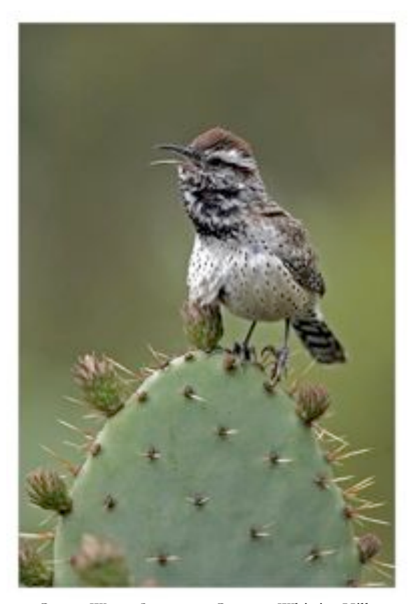
Cactus Wren, Sycamore Canyon, Whittier Hills (ph. by Raul Roa, 2008)