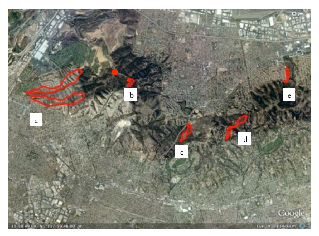
Figure 1. Regional map showing general area of Cactus Wren territories discussed in text. From west to east, they are: a) Sycamore Canyon/Hellman Park (= "Whittier Hills"), b) Upper Turnbull Cyn., c) Arroyo San Miguel (recent records from 2008; unrecorded spring 2009), d) Hacienda Blvd. area, and e) Schabarum Park. The red dot northwest of area "b" is the location of a small cactus patch at the base of a transmission tower where a pair of Cactus Wrens were observed in 1997.

A total of 23 territories of the Coastal Cactus Wren were mapped and monitored in the western Puente Hills, all on south- or southeast-facing slopes. Within this area, the majority of sites/territories (n=16) were located in the Whittier Hills, split between slopes in and around Hellman Park (n=10) and Sycamore Canyon (6 sites). Figure 1 depicts the areas found to currently/recently support Cactus Wrens in the western Puente Hills, discussed in detail below.