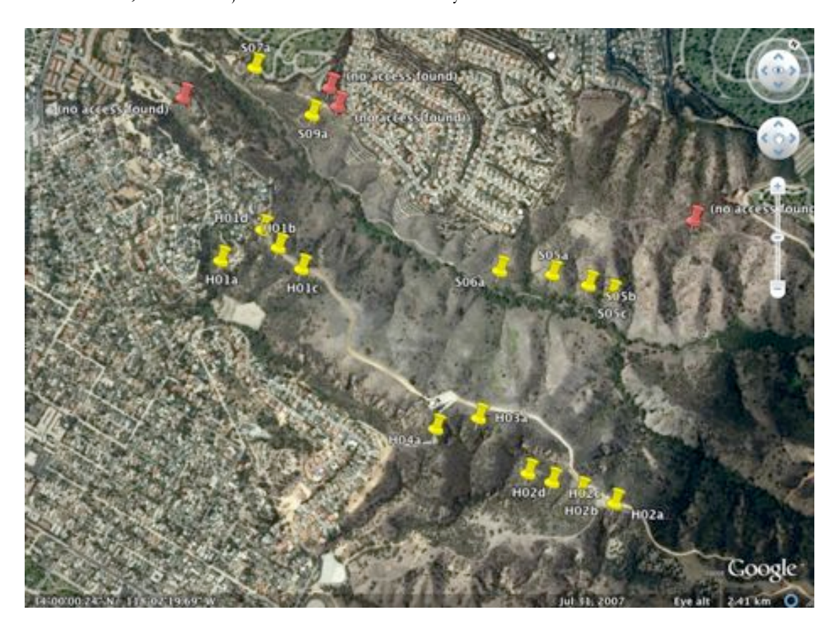
Figure 2. Cactus Wren territories in the western Whittier Hills (yellow pins). Red pins indicate appropriate habitat that was un-surveyed due to access issues. Unique alpha-numeric codes are explained in text.

In addition to these 23 sites, at least four potentially suitable areas of extensive cactus scrub were identified in Sycamore Canyon that were not accessible to surveyors during the study due to rugged terrain or private property boundaries, so the actual number of territories in the western Whittier Hills alone could be as high as 20 pairs, if not slightly higher (Fig. 2). In terms of land ownership, all but three of the known sites within the Sycamore-Hellman area were on lands managed by the Habitat Authority; the remaining three, plus the four sites not visited due to access issues, were all adjacent to Habitat Authority lands.