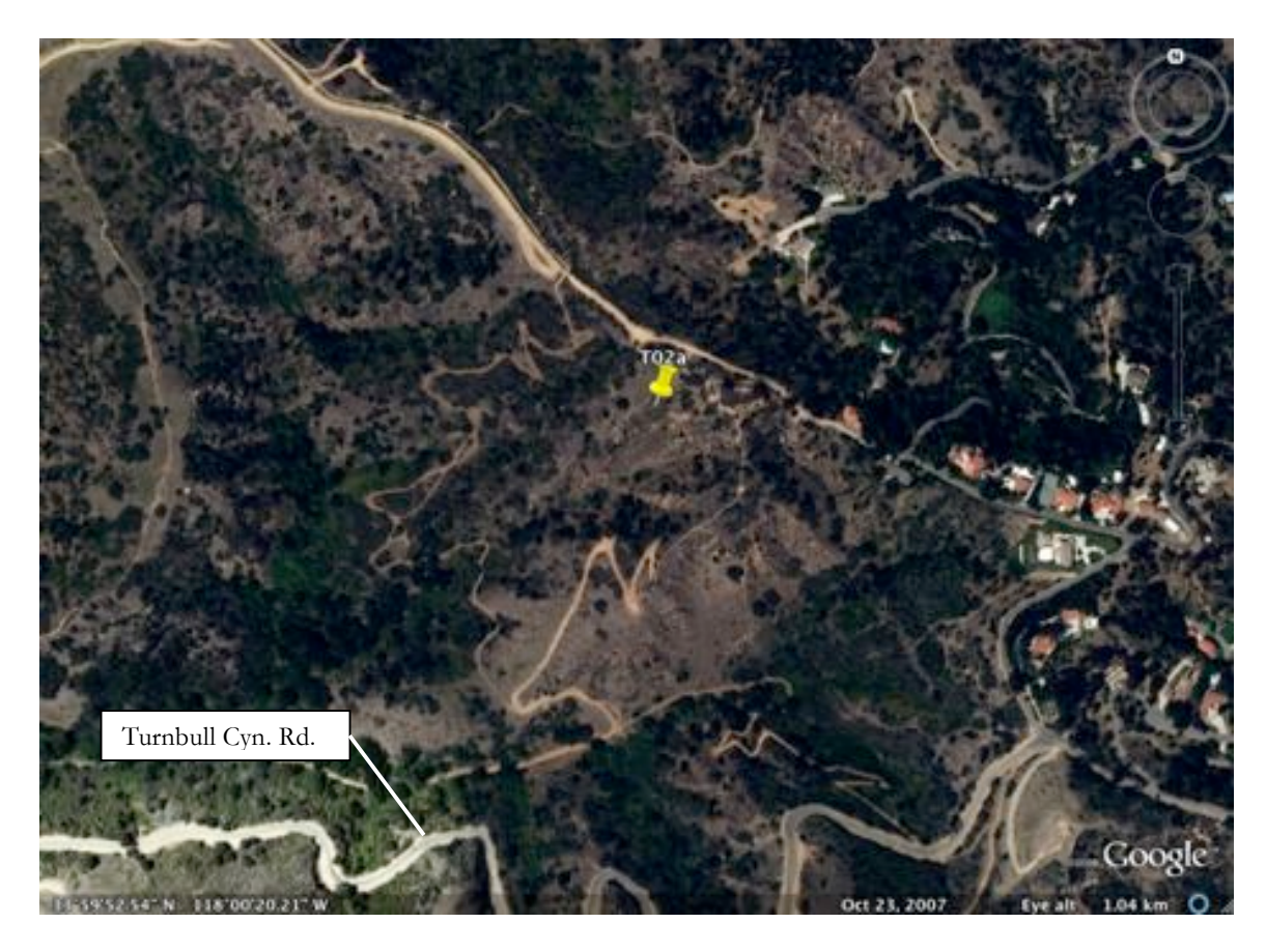
Figure 5. Cactus Wren territory, upper Turnbull Cyn. In 1997, a pair of Cactus Wrens was observed at the base of a transmission tower just off the upper left corner of the image.

As for nesting success, further analysis of the submitted maps and datasheets is required to determine outcome for these territories (volunteers often did not note nests and sightings on datasheets and/or maps, or did so incompletely, which has proven time-consuming to decipher). However, nests were observed at nearly all territories, and only one territory of the 23 mapped (SC03a, at Schabarum Park; see above) had nests but no birds.