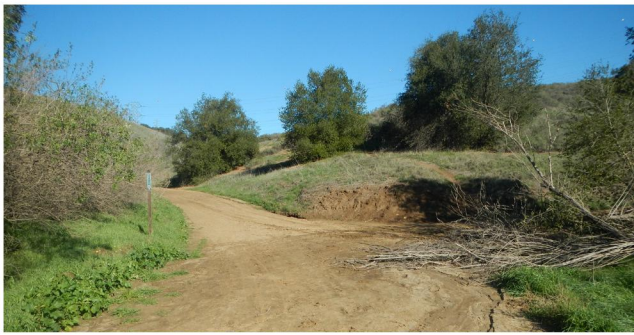
View of Powder Canyon Trail (OPDMD segment).