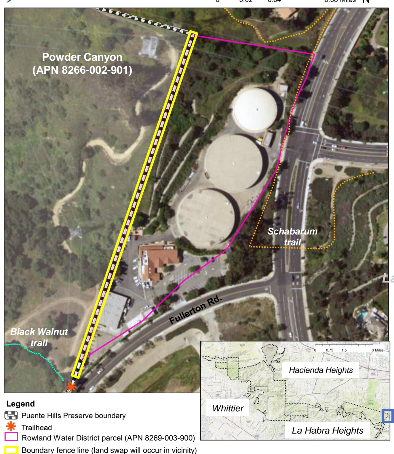
Exhibit C. Rowland Water District Land Swap Powder Canyon