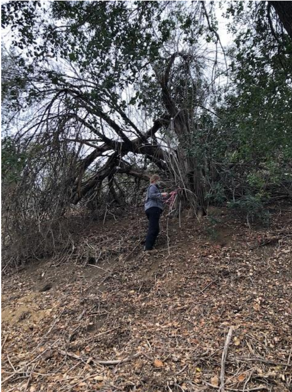
Figure 5. Priority 1 level tree on Oak Ranch Rd - trim dead materials (#49 on map)