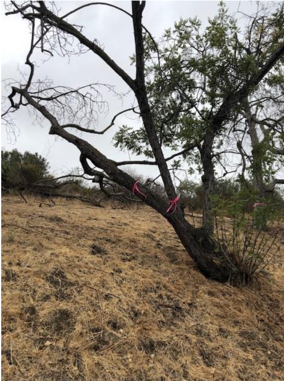
Figure 3. Priority 1 level tree - for trimming of dead material - Oak Ranch Rd (#47 on map)