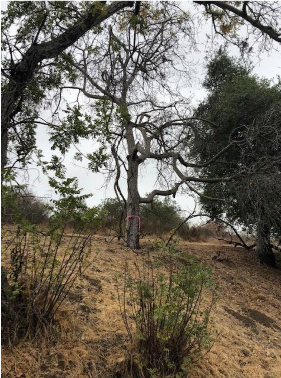
Figure 2. Priority 1 level tree - for removal on Oak Ranch Rd (#46 on map)