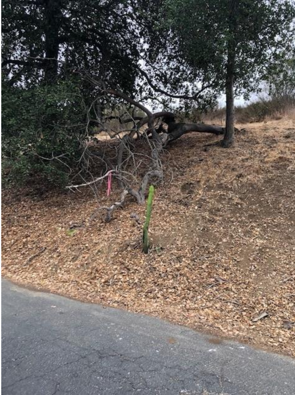
Figure 1. Priority 1 level tree on Oak Ranch Rd previously identified as a trim - is now a removal. (This is the most western tree, #45, on Oak Ranch Rd on the map.)