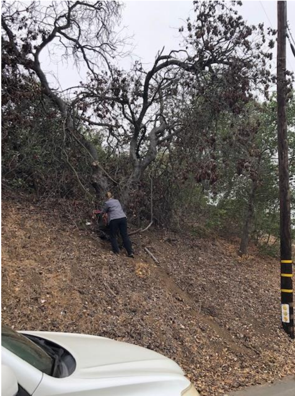
Figure 4. Priority 1 level tree on Oak Ranch Rd - remove tree (#48 on map)